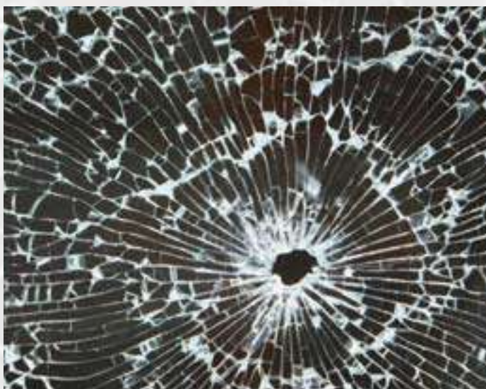
A bullet hole in window glass.

When a bullet strikes a pane of ordinary window glass, careful observation can reveal several crucial details. First of all, glass has a certain degree of elasticity and will break when this elastic limit is exceeded. This elasticity produces the familiar pattern of concentric and radial fractures that accompany penetration of glass by a projectile. The radial fractures are produced first and always form on the side of the glass opposite to where the