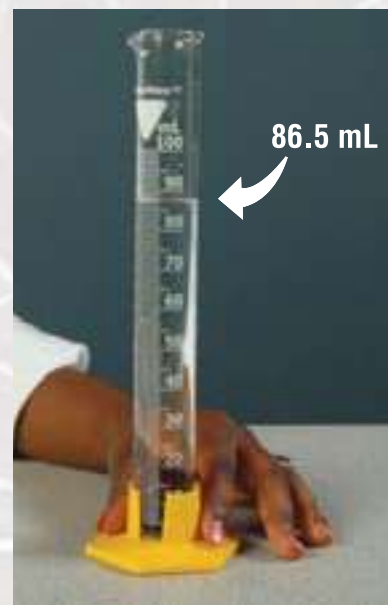
The formula method for determining density: After finding the mass of an object, measure its volume by water displacement.