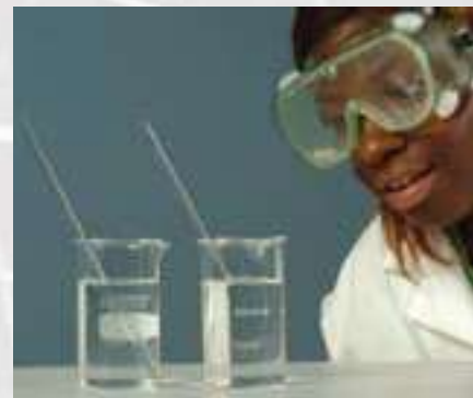
The beaker on the left contains water and the one on the right, glycerin. Both beakers also contain a glass stirring rod. Because the glass rod and glycerin have the same refractive index, the glass rod in the beaker on the right seems to “disappear.”

Glycerin has a refractive index of 1.473. If a piece of glass seems to disappear in glycerin, then it too has a refractive index of 1.473. If two samples of glass have the same refractive index, this does not necessarily prove they are from the same source. But if two samples have different refractive indexes, they are definitely not from the same source. The FBI has a database of refractive index values for approximately 2000 different types of glass, allowing forensic scientists the ability to identify samples. The most common value for the refractive index of glass is 1.5180.